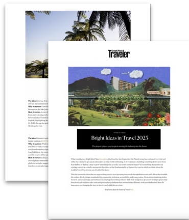
“Bright Ideas in Travel 2023”