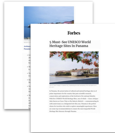
“5 Must-See UNESCO World Heritage Sites In Panama”